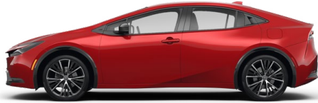
2024 TOYOTA PRIUS HEV