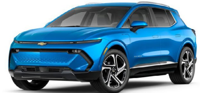
2024 CHEVROLET EQUINOX EV

PRO: More robust battery. Works with smaller gas engine to achieve 30%–60% better fuel economy. CON: battery range 14–65 mi.