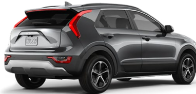
2024 KIA NIRO PHEV

PRO: Can run on battery power alone during light acceleration. 80% less idling. 25%–40% better fuel economy. CON: Still gasoline dependent.